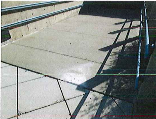
Southwest Ramp repair